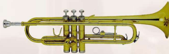
TROMBA TRUMPET Mod. CR 202SS Chiave del Sib Laccata Argentata su richiesta Bb key Gold lacquered Silver plated on request